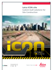
Leica iCON site brochure