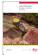
Leica iCON grade brochure