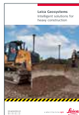
Intelligent solutions brochure

Copyright Leica Geosystems AG, 9435 Heerbrugg, Switzerland. All rights reserved. Printed in Switzerland – 2024. Leica Geosystems AG is part of Hexagon AB. 869968en – 05.24