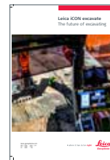
Leica iCON excavate iXE3 brochure